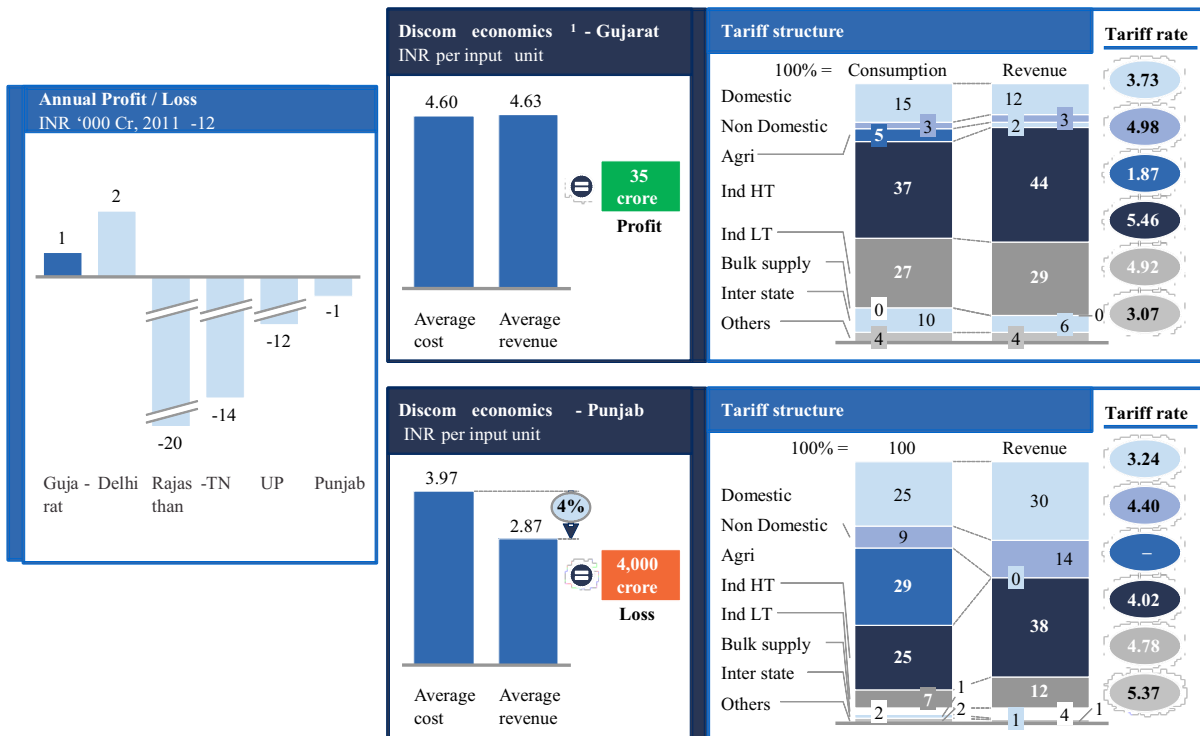
Figure 3: Losses of Discoms due to cost- revenue mismatch

been able to commission their projects and commence power supply in accordance with their agreements with various distribution utilities. This has not only led to a slowing down of loan disbursements to projects under implementation, it has also led to defaults in debt service by many developers because of their inability to generate the requisite revenue streams for want of fuel. As a result, a large number of power projects are likely to become non-performing assets (NPAs), if some relief is not provided by way of restructuring or re-scheduling of their loans.